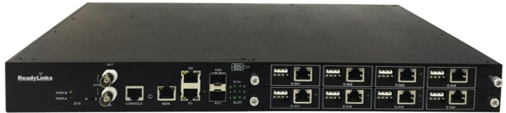
GL-8xMTv2 (Headend in Cable Closet)