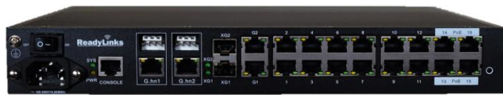
GL-2xMTv2 (Switch in Slot Bank)