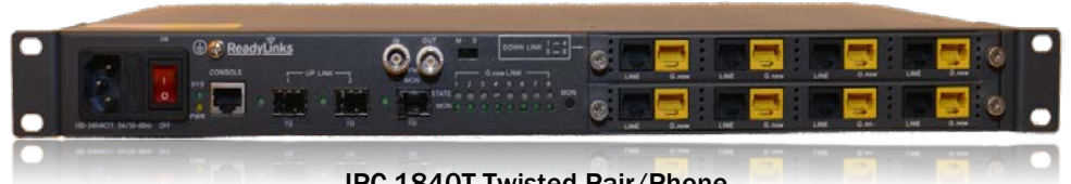
IPC-1840T Twisted Pair/Phone