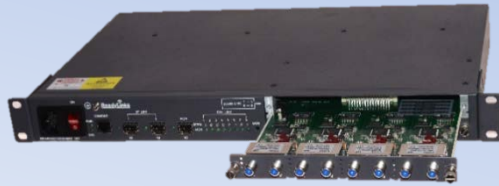
IPC-1840 (coax or phone)